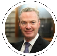
Hon. Christopher Pyne Chairman Former Australian Defence Minister

The NIOA Group Board is dedicated to ensuring the organisation's objectives and behaviours are consistent with its Vision, Purpose and Values.