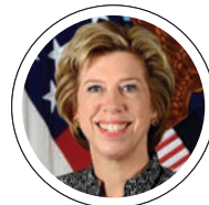
Hon. Ellen Lord Former US Under Secretary of Defense for Acquisition and Sustainment