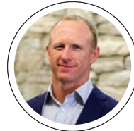
Mr Mark Donaldson VC Australian soldier and Victoria Cross recipient